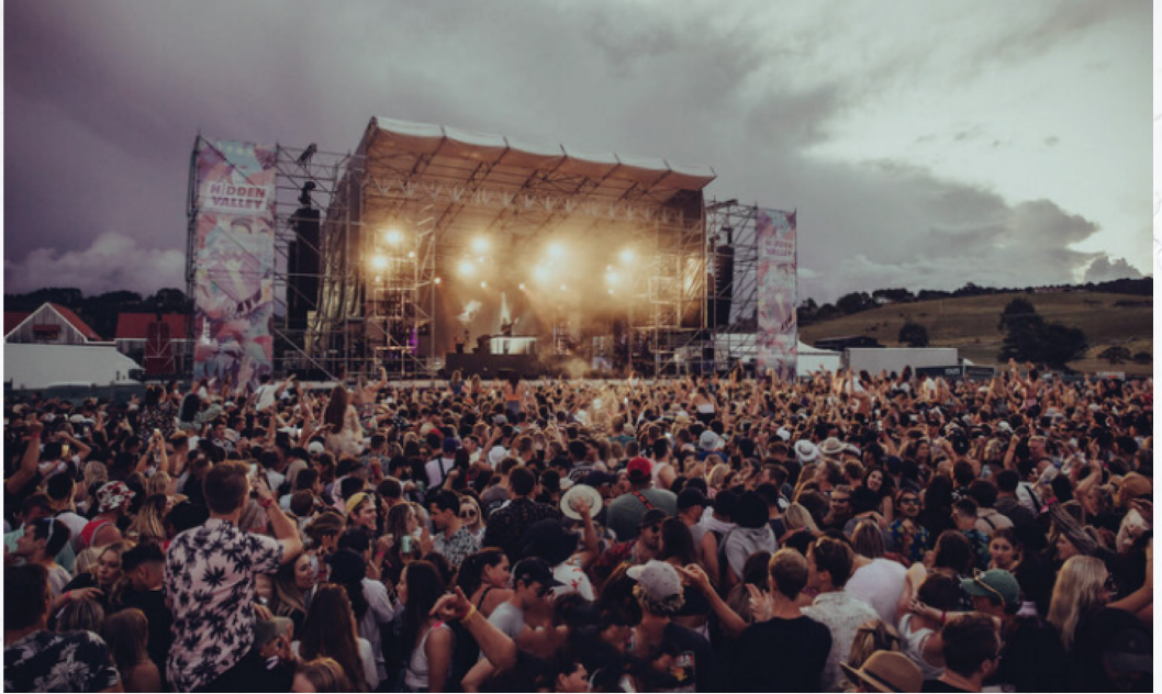
The Stables Lawn Concerts up to 3,000 capacity